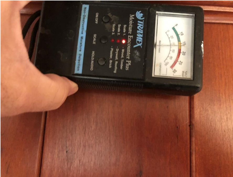
Stain in the wood *****

The restoration company must dry the site to pre loss condition, and in doing so, it is important to do it gradually when it is a finished cherry or other exotic species, to avoid causing permanent cupping conditions.