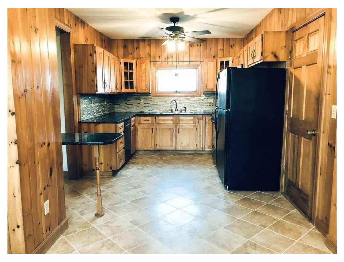
We did this farmhouse kitchen with Cambria® Black Gunbarrel quartz countertops, a glass tile backsplash and black appliances. The new lighting fixtures and diamond floor tile installation make this kitchen pop.