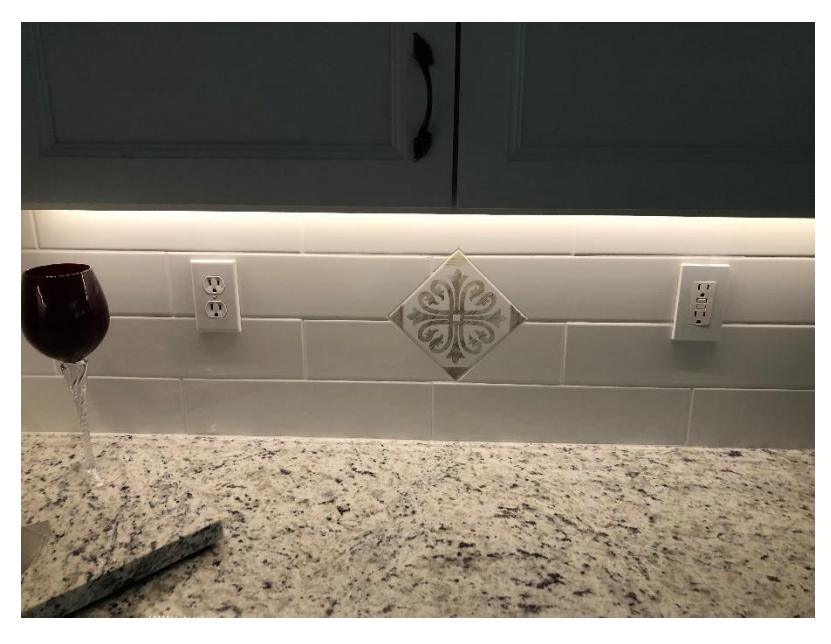
Then, the job was completed with under-cabinet lighting and a backsplash with inlays. The granite company in Pensacola included a free cutting board with their product. Nice!

Looking to avoid breaking the bank? If the cabinet boxes are solid, we often recommend and subsequently install American made and sourced Walzcraft cabinet doors and drawer faces instead of full replacement. Doors can be ordered primed and with cup hinges already routed for installation. These cabinets boxes, doors and drawer faces were refinished with superb quality INSL-X CabinetCoat® products, All 3500 Benjamin Moore colors are available for use with this particular INSL-X product line.