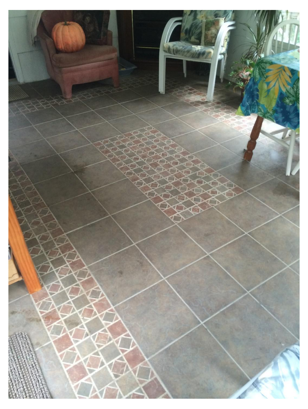
THIS IS A FOUR SEASON SUNROOM/LANAI WITH CUSTOM INLAY AND BORDER USING A NON-SLIP 12\mathrm{x}12 TILE