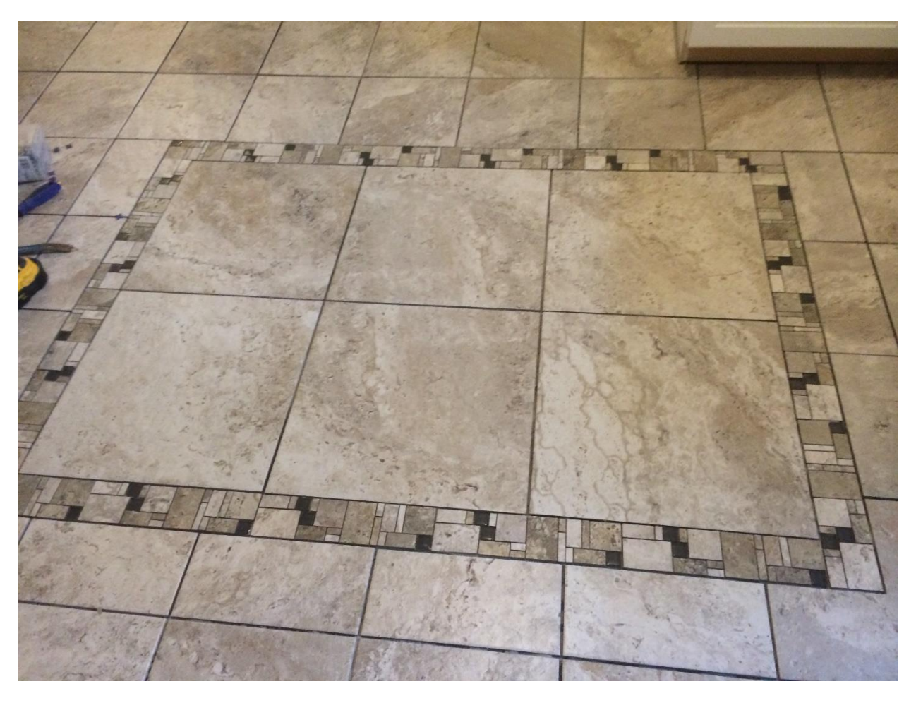
THIS CUSTOM KITCHEN FLOOR WITH INLAY PATTERN WAS DONE BY ADVOCATE IN THIS BEACH CONDO ON THE PIER IN NARRAGANSETT, RI