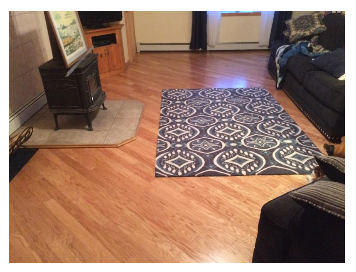
THIS IS AN ENGINEERED OAK FLOOR. THIS DIAGONAL PATTERN WAS INSTALLED OVER A VAPOR BARRIER ON-SLAB. WE ALSO BUILT THE HEARTH SLAB, AND DID A TILE HEAT SHIELD BEHIND THE WOOD BURNING STOVE AT THE HOME.