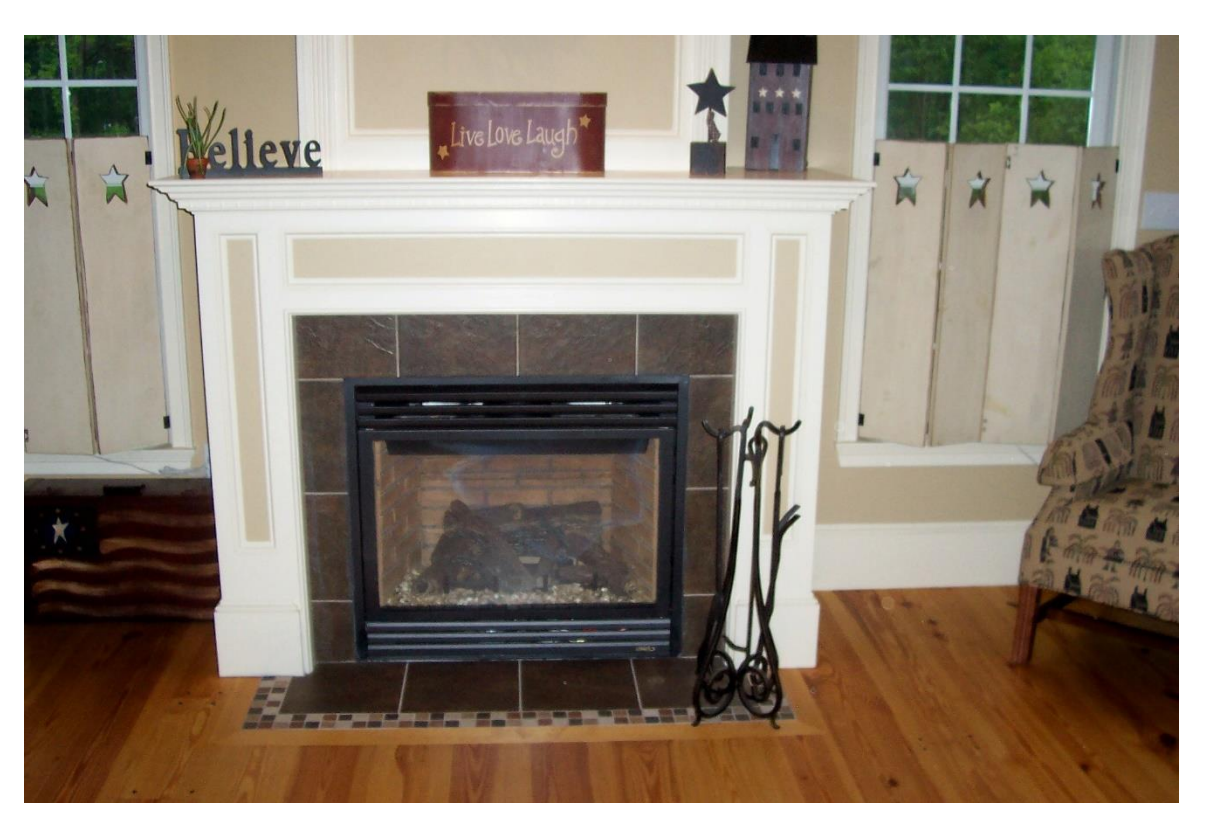
HEART PINE MOPPED OIL HARDWOOD FLOOR. ADVOCATE ALSO DID THE FIREPLACE AND THE FRONT TILE WORK ON THE HEARTH.