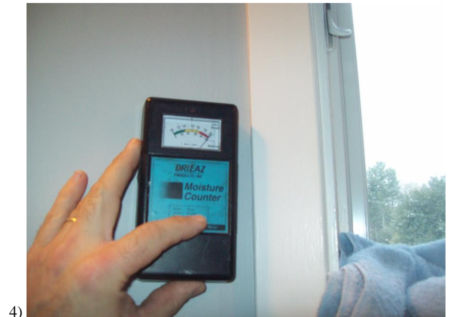
Stairway landing area at xxxxxxxx Court, North Smithfield