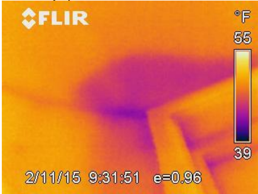
5) Basement stairs images