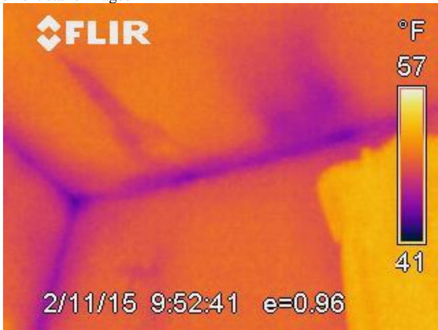
7) Master bathroom images