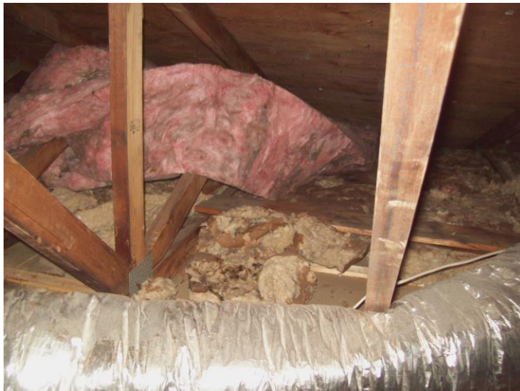
MASTER BEDROOM AND THE AFFECTED ATTIC AREA IMMEDIATELY ABOVE IT.