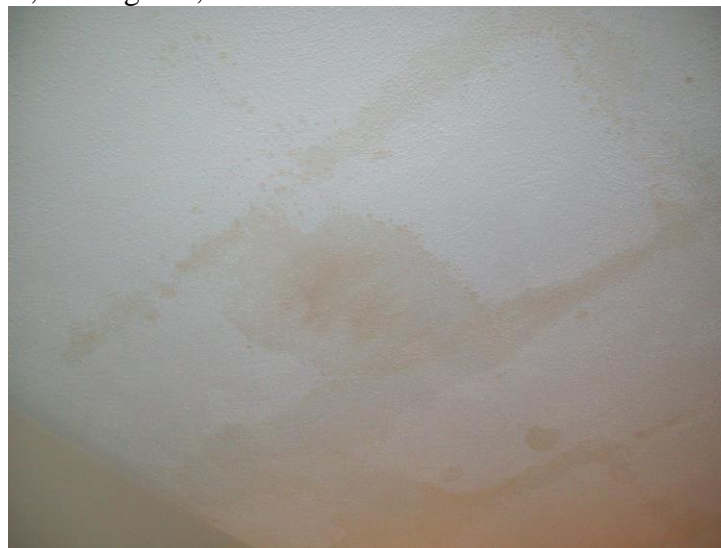
Music room adjacent to master bedroom.