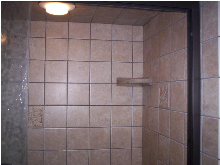
Bas-Relief accent tiles on this 8 inch tile tub surround with shelf unit and tile ceiling bonnet with a waterproof shower fan light combo and bronzed shower door system.