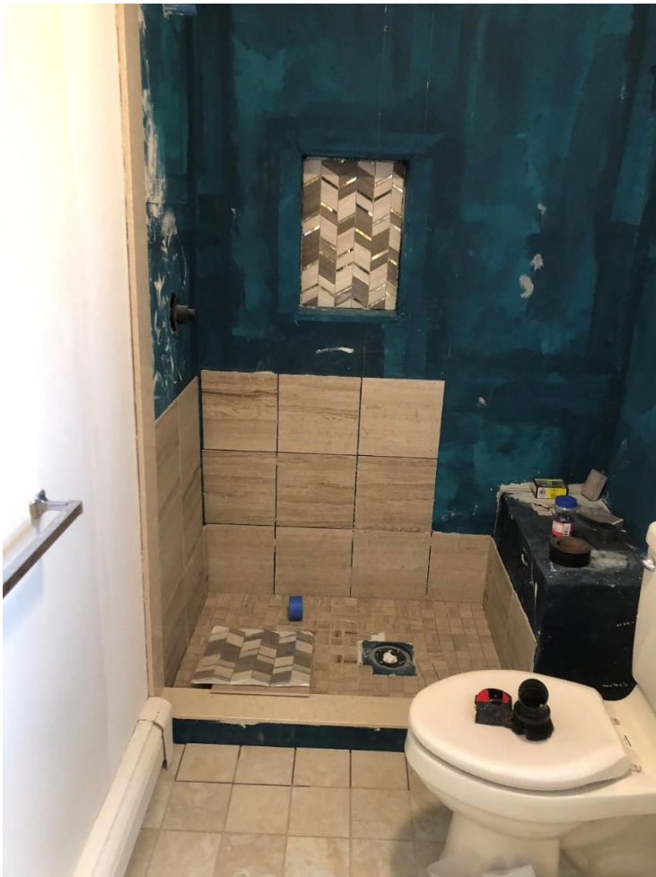
KBRS – Building the beast from the ground up. Best product of its kind. Period.