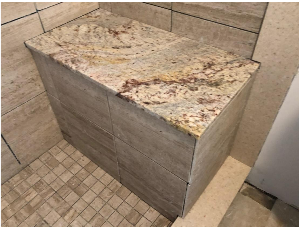
Custom granite – Advocate had to carefully cut the shower dam and install it around the KBRS bench seat prior to setting the granite dam slab. Mitered the corners