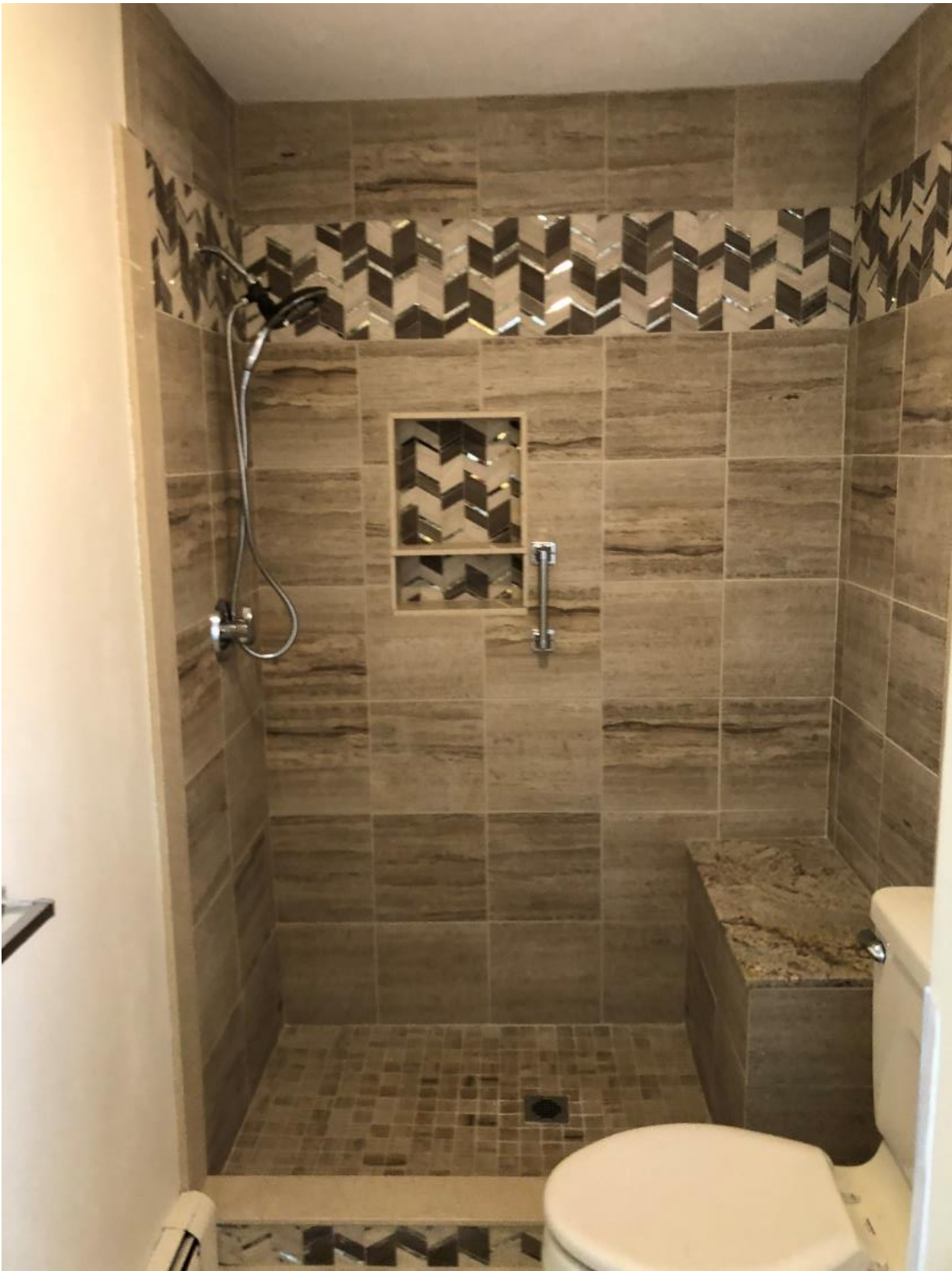
Yep, that's all she wrote -no wait - she did write me a referral on the website.....