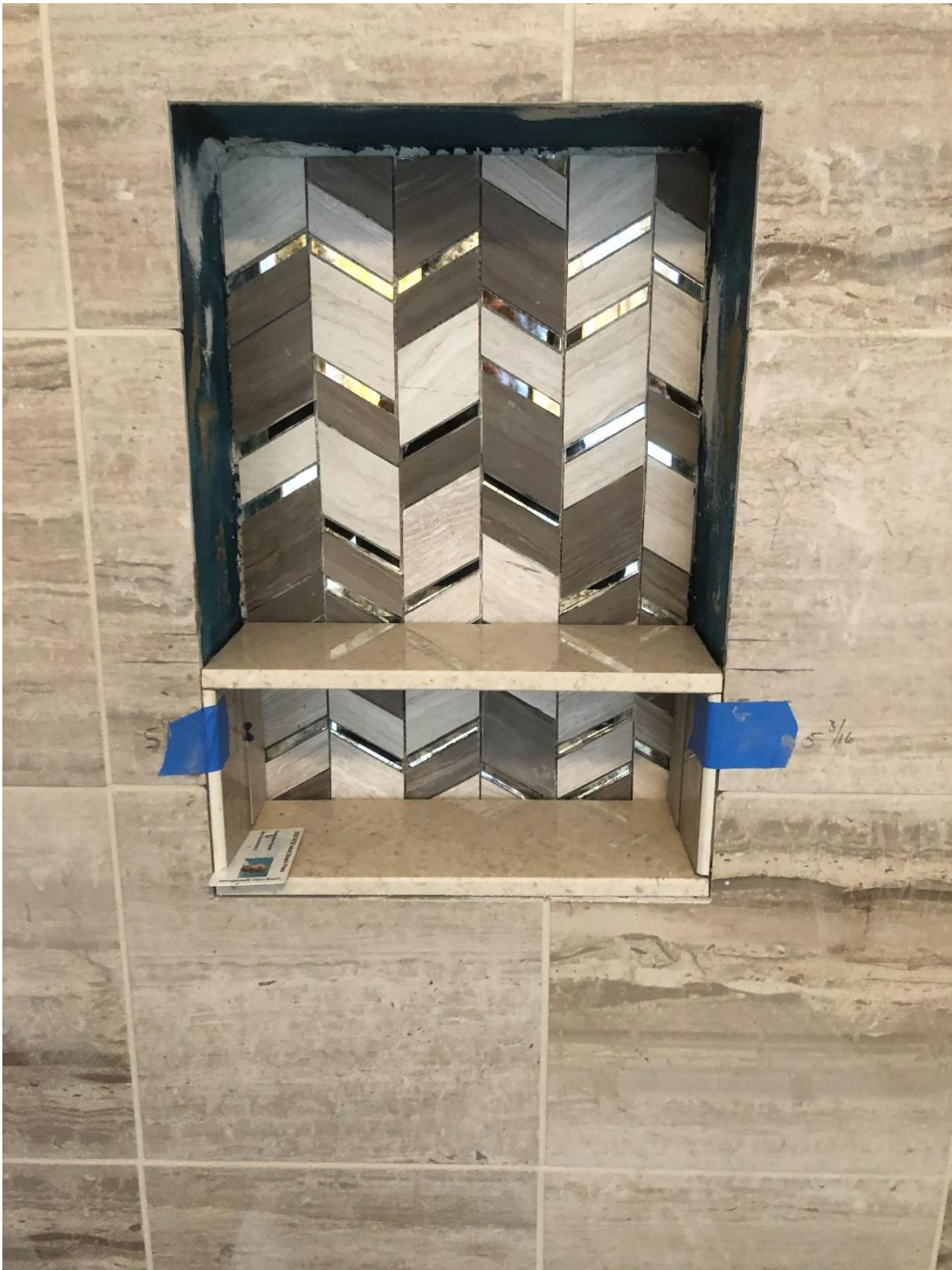
Setting the niche, keeping it level but sloping the pitch of the bottom shelf away from the outside wall of the house using my driver's license as a shim – listen, I had a deadline here.....and no, that is not duct tape.....so no jokes, please.