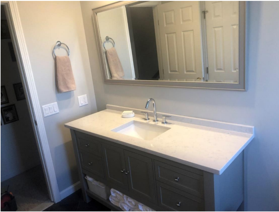
Custom granite counter and backsplash with a square sink – these are getting popular. Delta fixtures here.