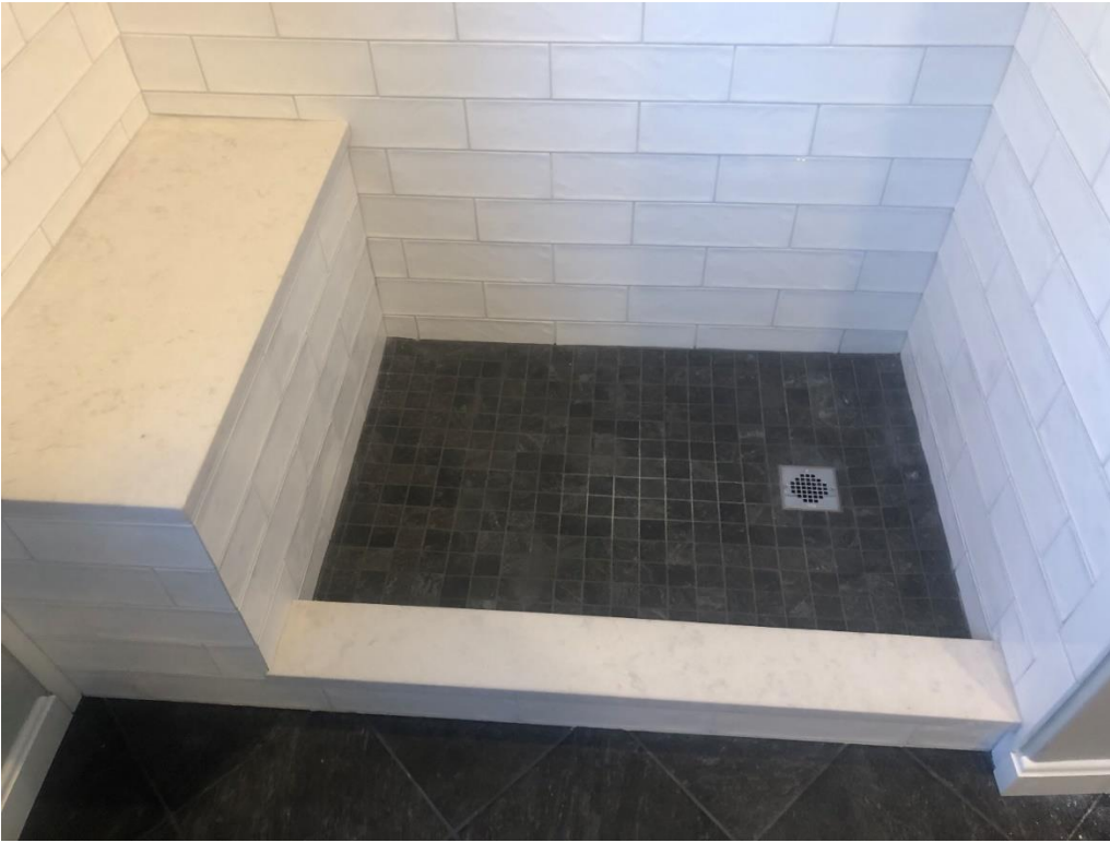
4x12" tiles on the walls, 2x2" tiles on the floor with a granite bench seat and granite shower dam