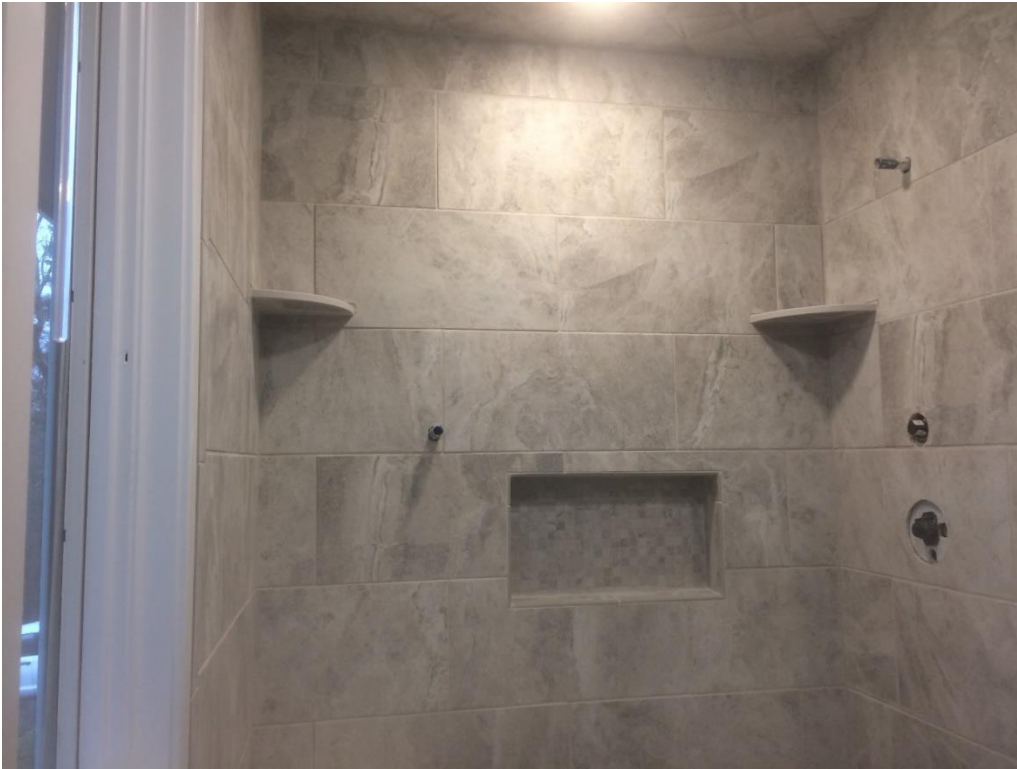
Niche and corner shelves for every bath product she could ever want.