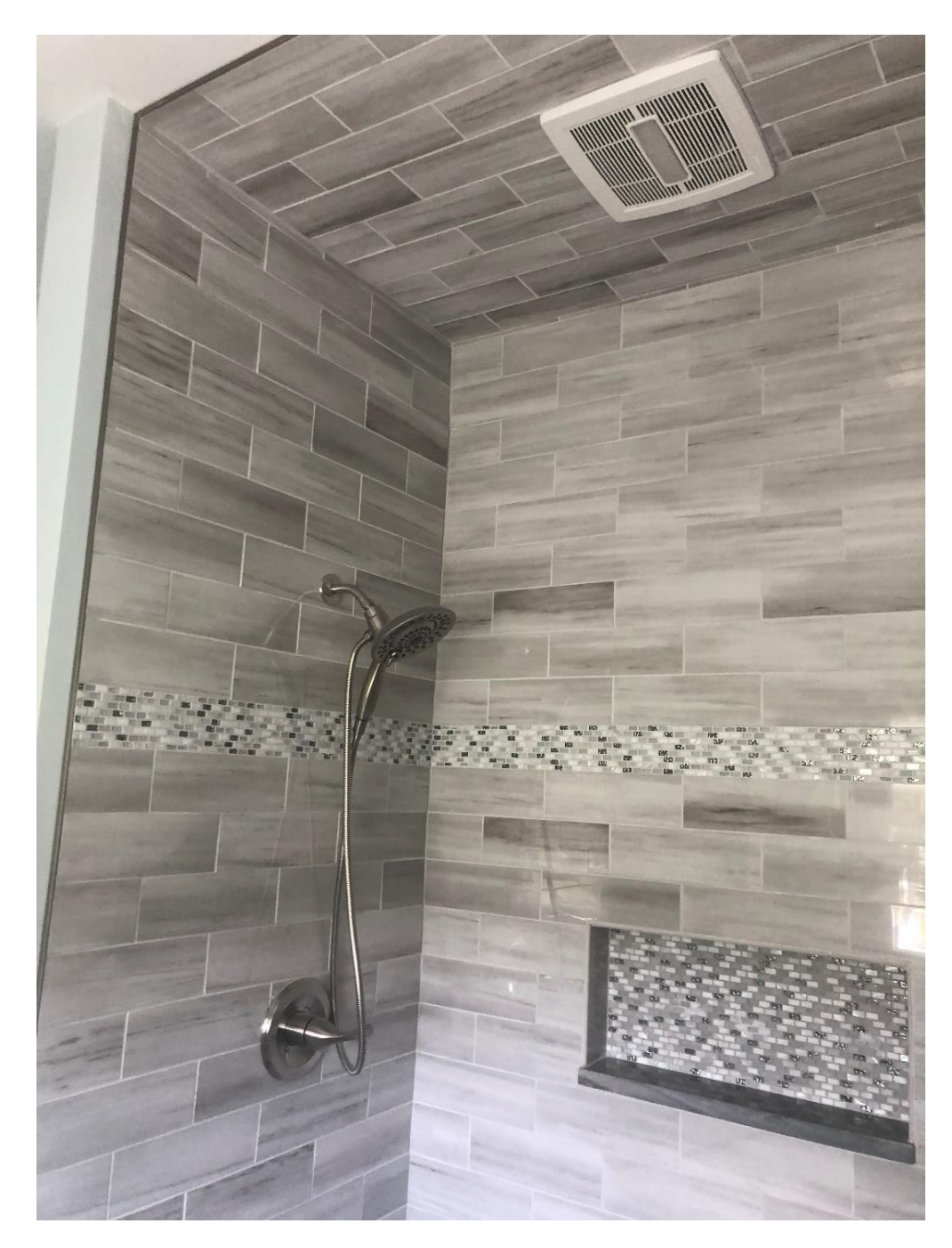
We used the same custom granite for the base in the shampoo/product niche, and the customer chose their own fixtures to complete this installation